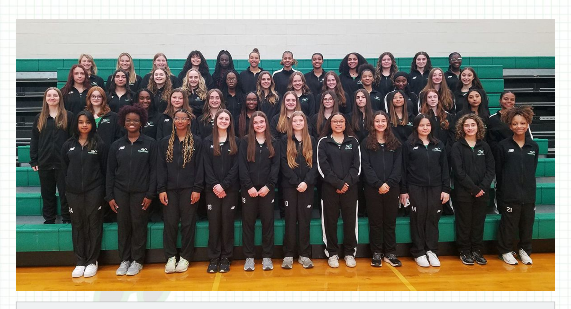
2023 CD Girls Track and Field Team