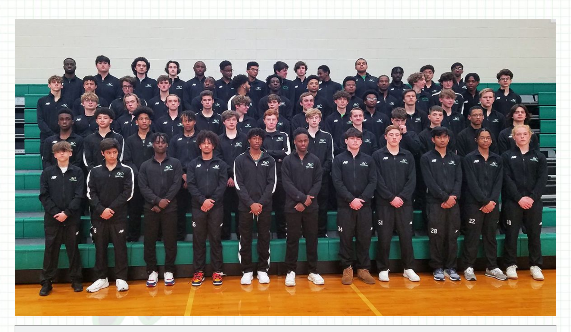
2023 CD Boys Track and Field Team