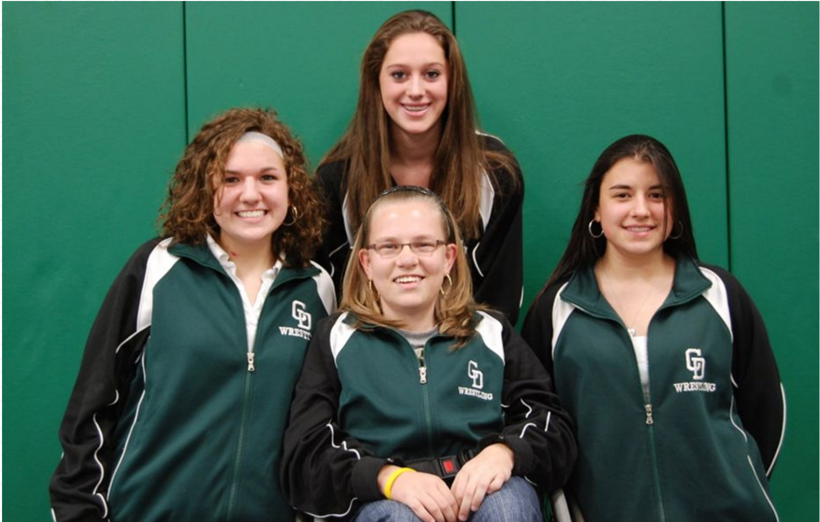
CD Wrestling Team Managers