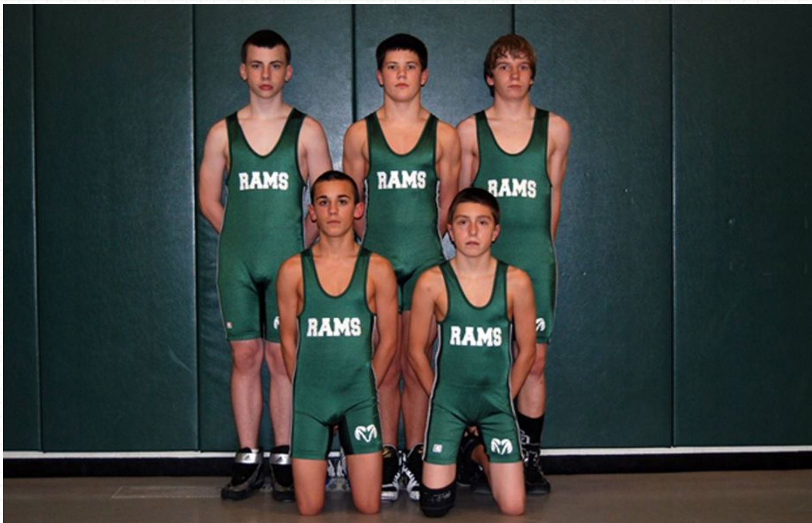
CD Wrestling Junior High Wrestlers