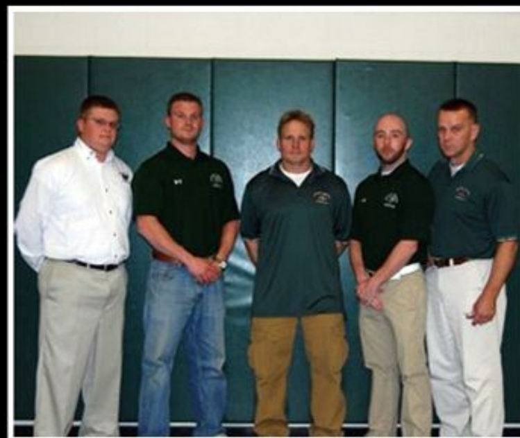
CD Wrestling Coaches