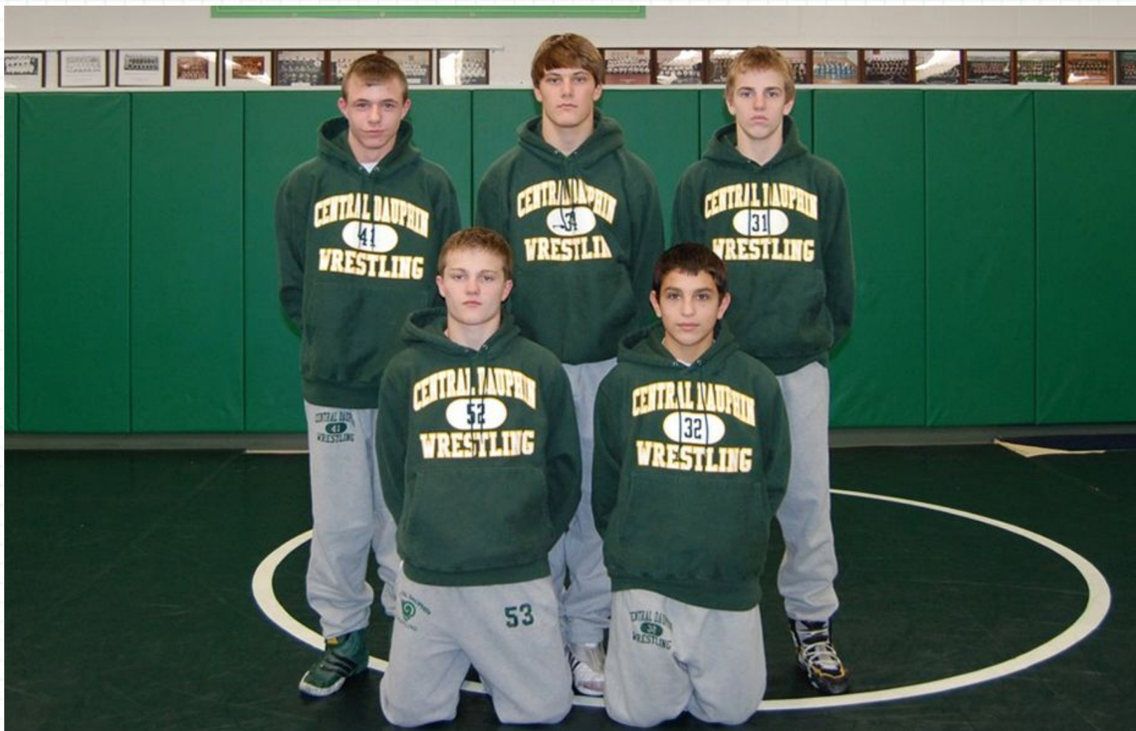
CD Wrestling Freshman Wrestlers