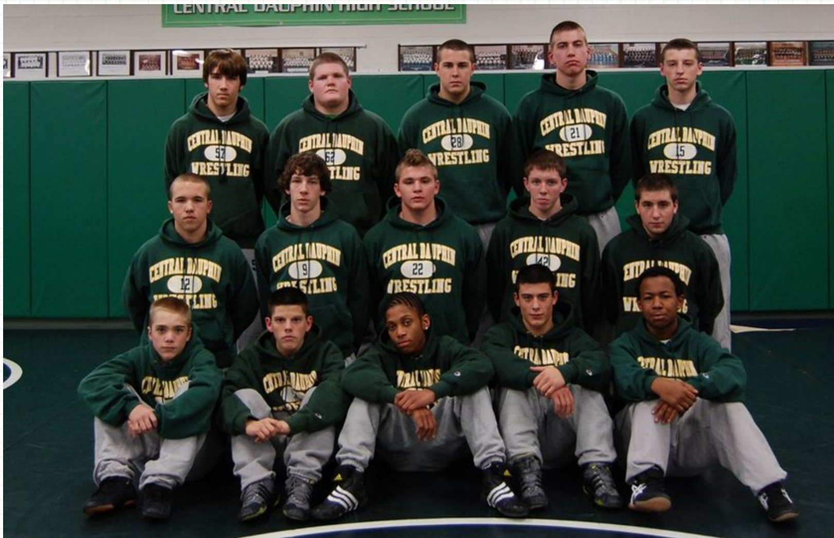
CD Wrestling Sophomore Wrestlers