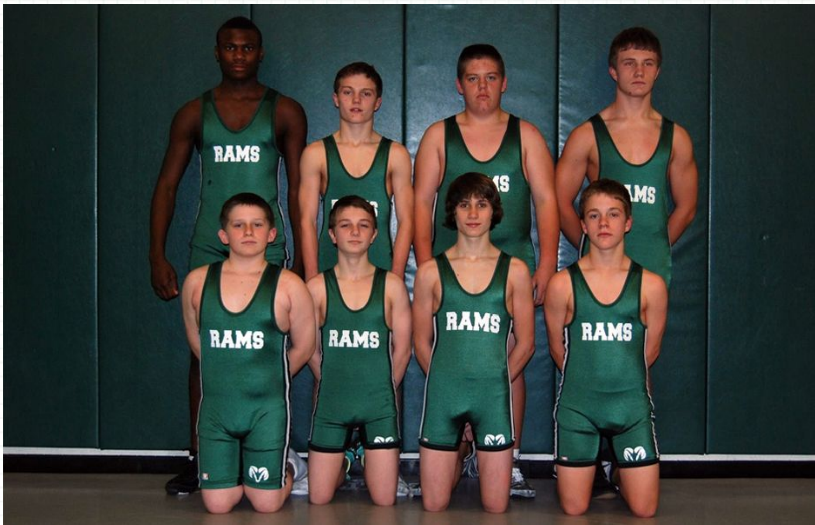
CD Wrestling Junior High Wrestlers