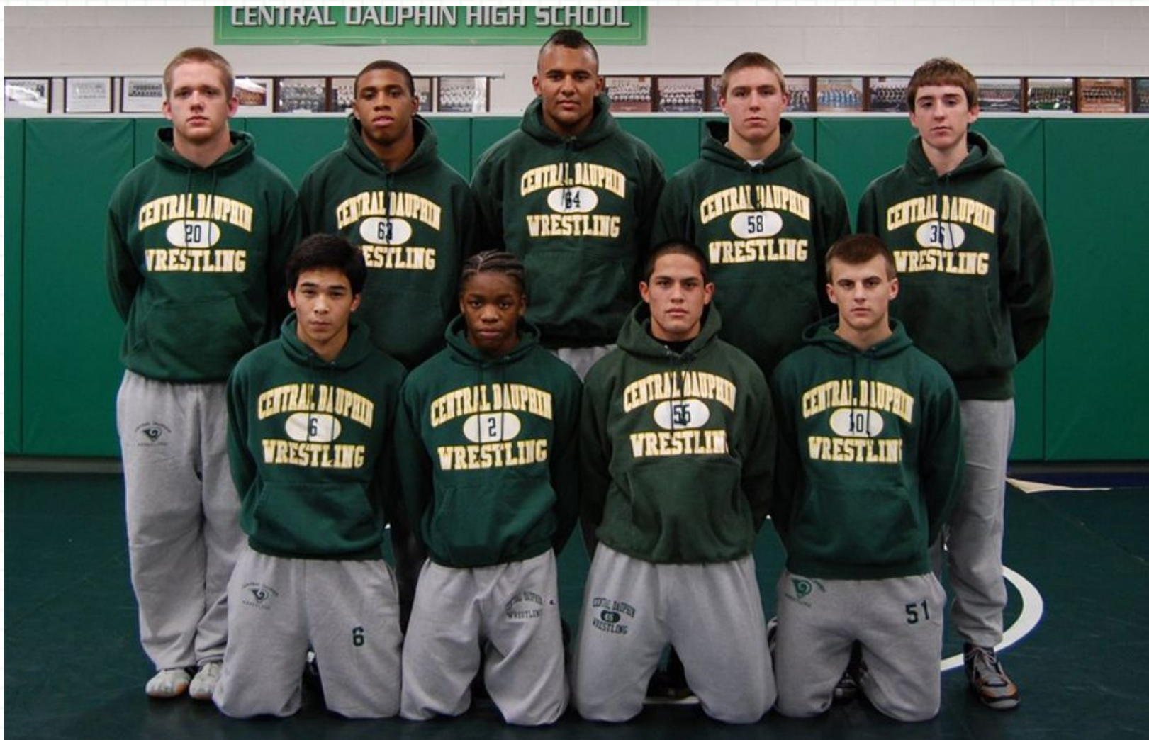
CD Wrestling Junior Wrestlers