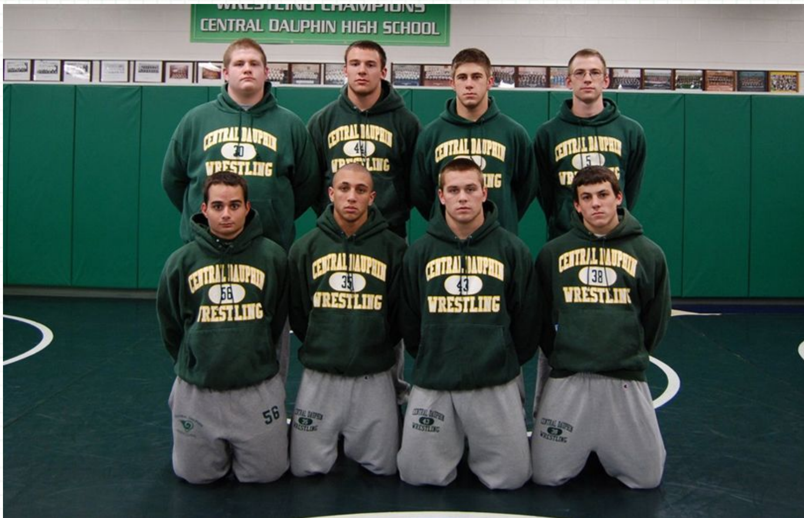
CD Wrestling Senior Wrestlers