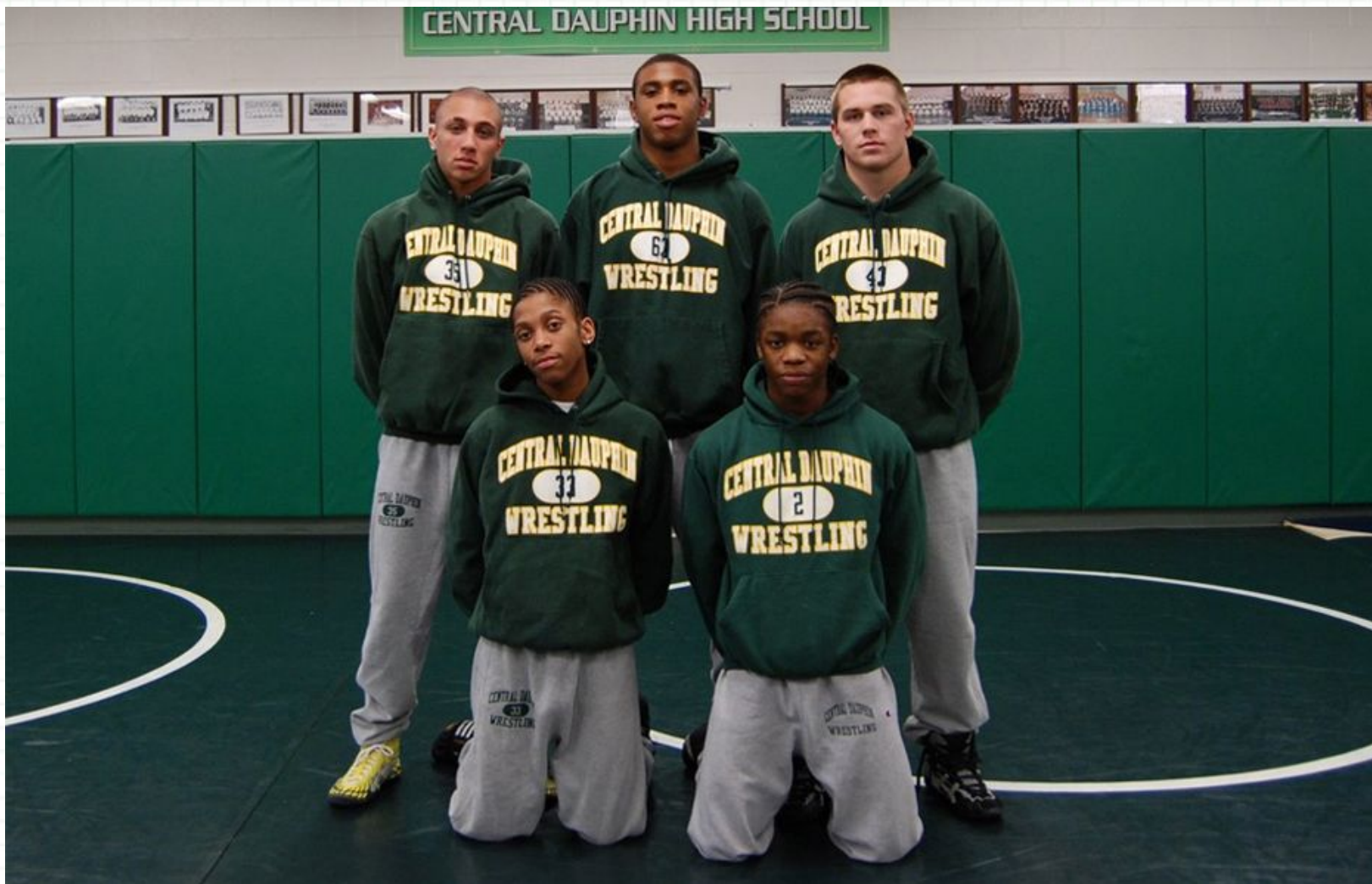
CD Wrestling State Qualifiers