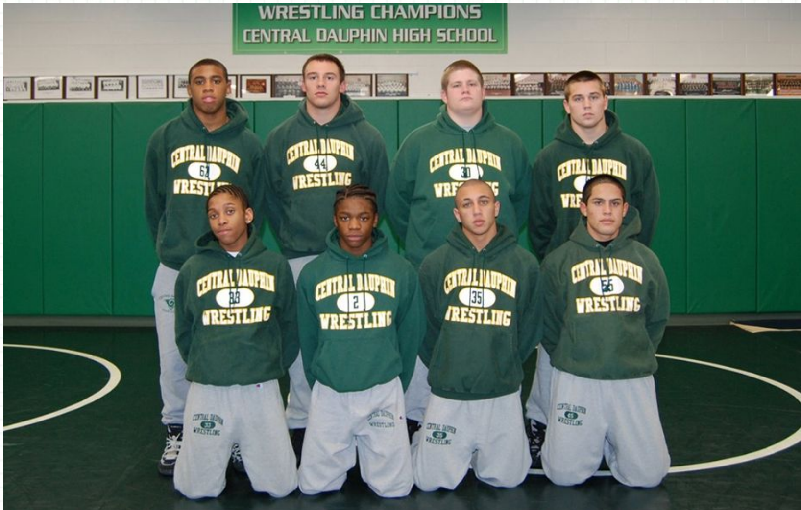
CD Wrestling Districts Qualifiers