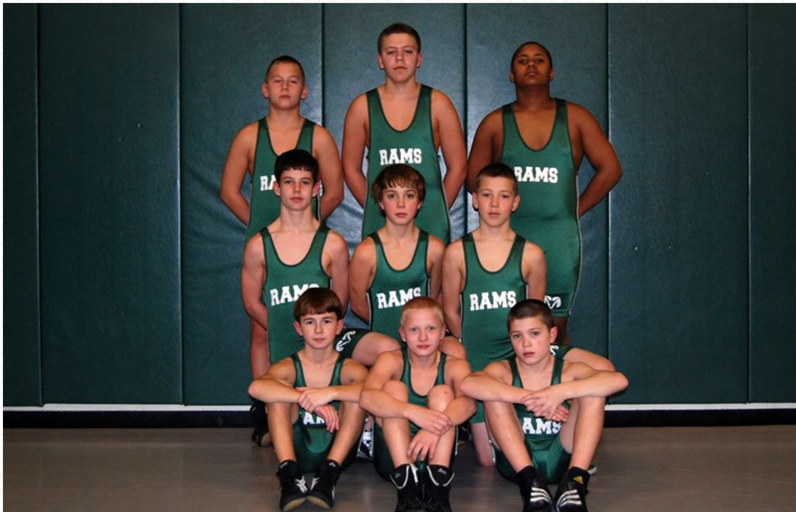
CD Wrestling Junior High Wrestlers