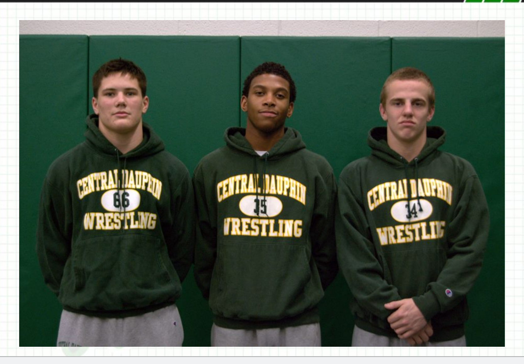
Returning State Qualifiers