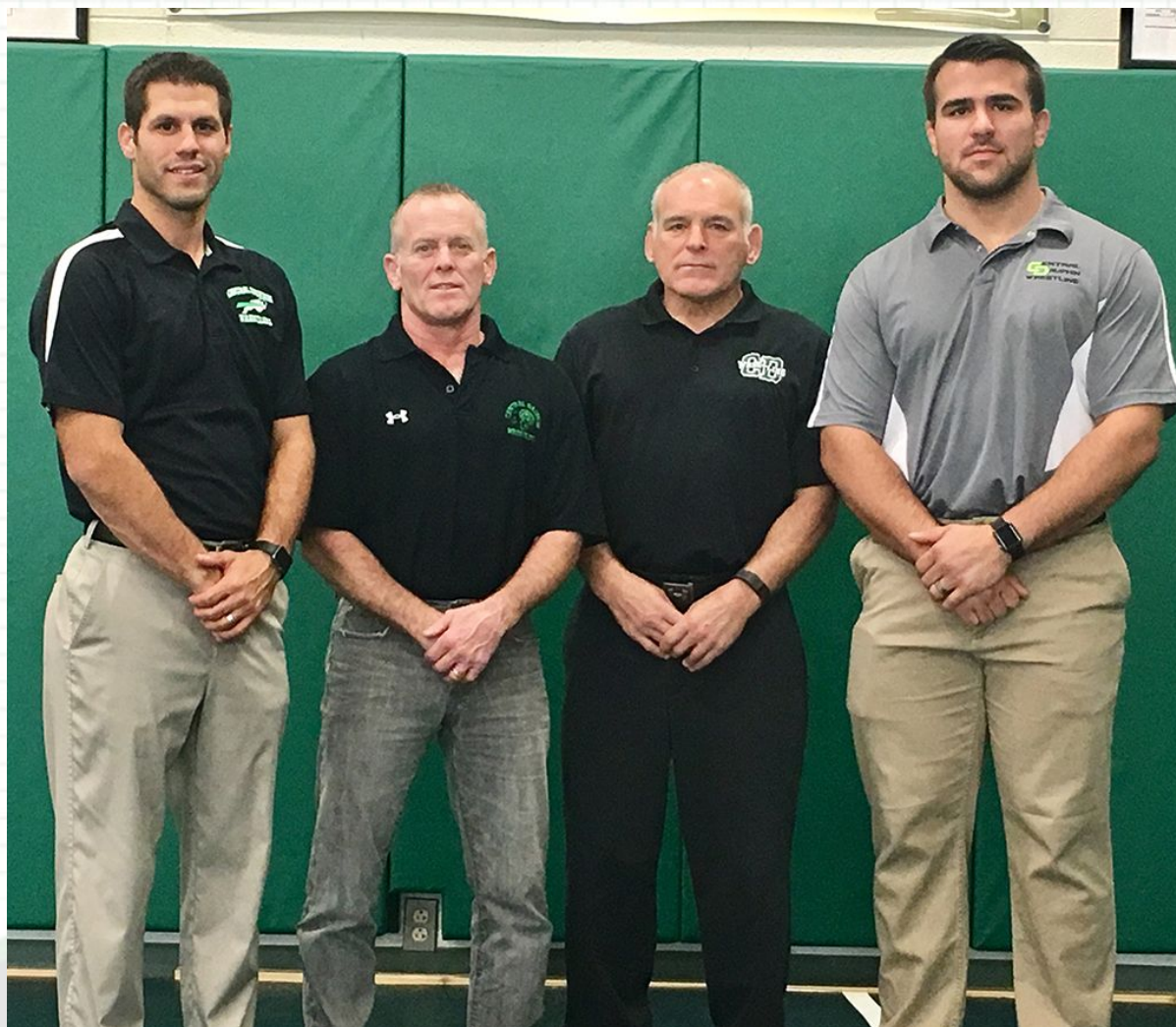
2017 - 2018 CD Wrestling Coaches