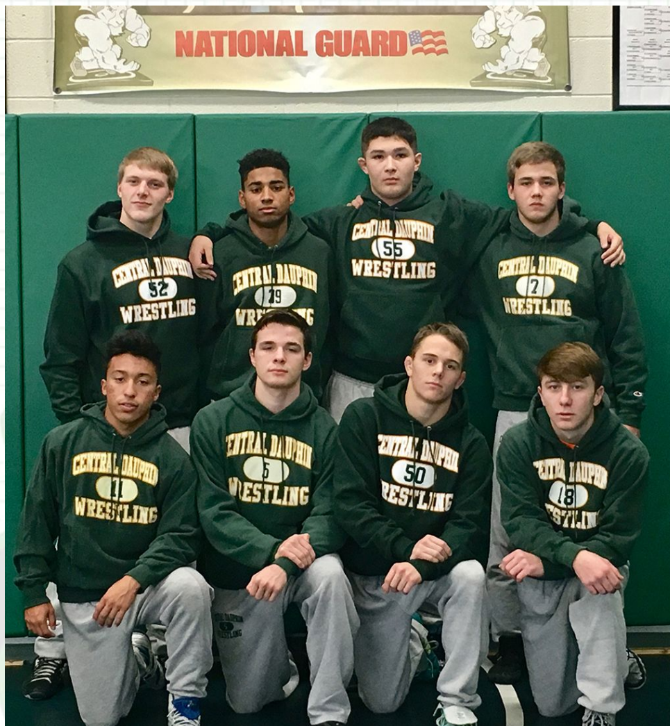
2017 - 2018 CD Wrestling Seniors