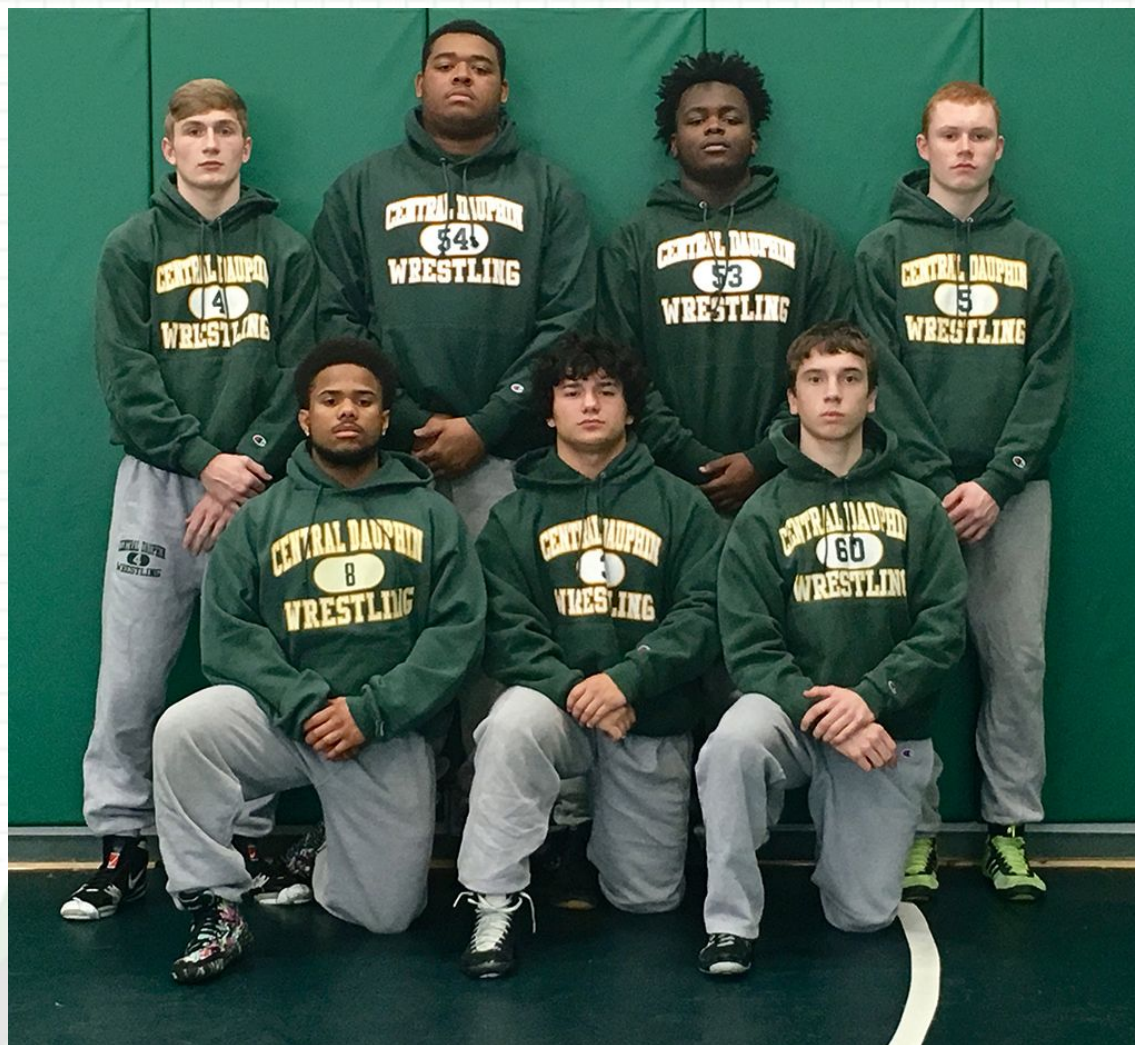
2017 - 2018 CD Wrestling Juniors