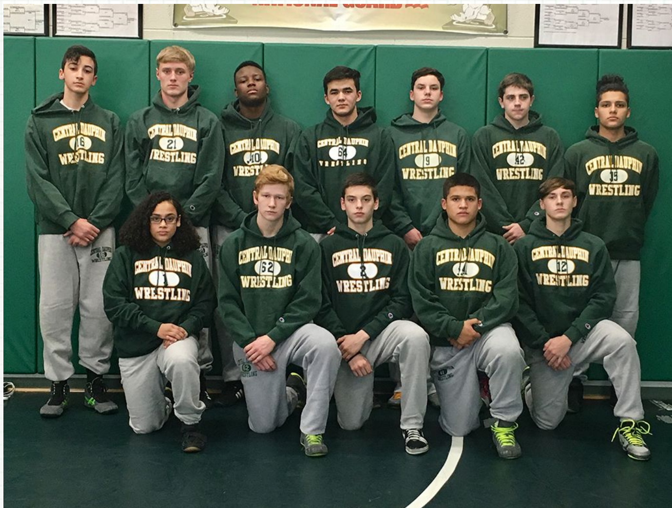
2017 - 2018 CD Wrestling Sophomores