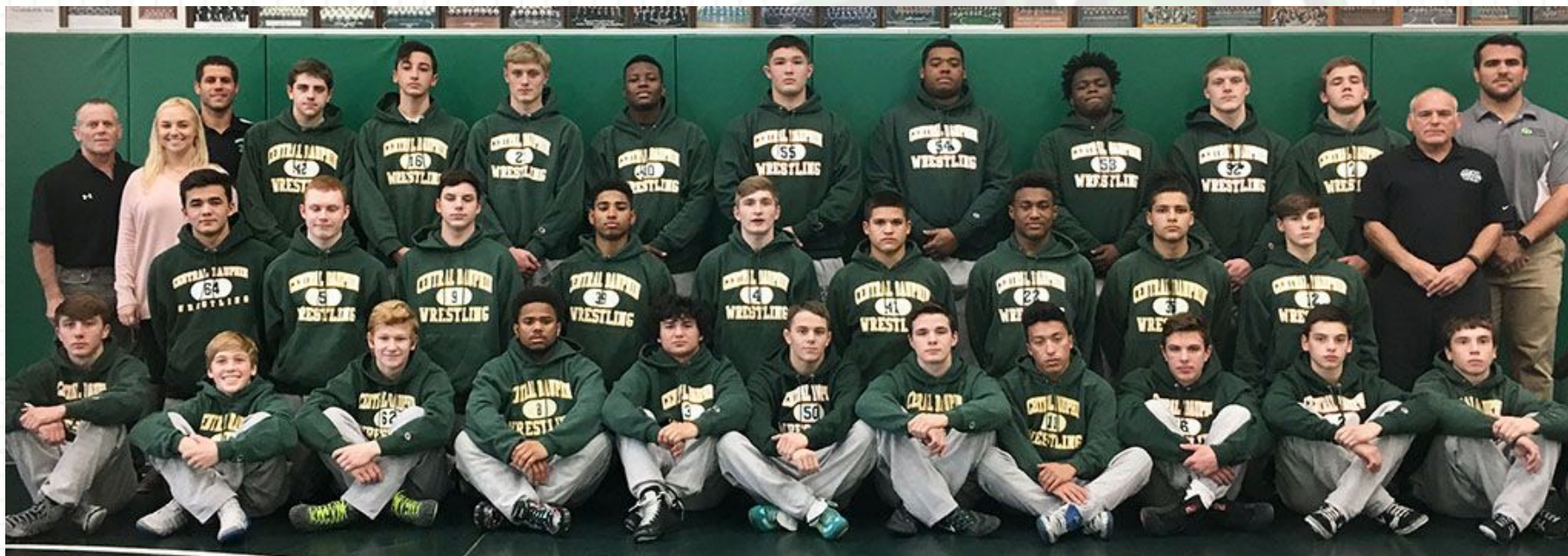
2017 - 2018 CD Wrestling Team