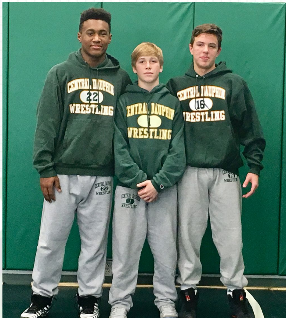
2017 - 2018 CD Wrestling Freshmen