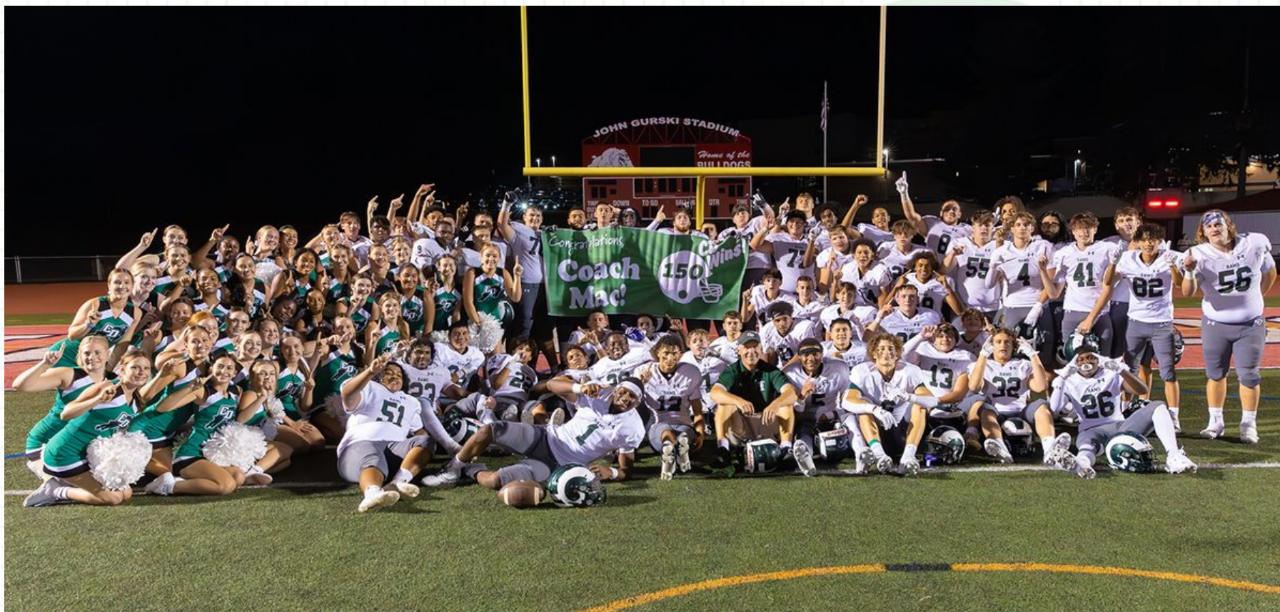
2023 - 2024 CD Football