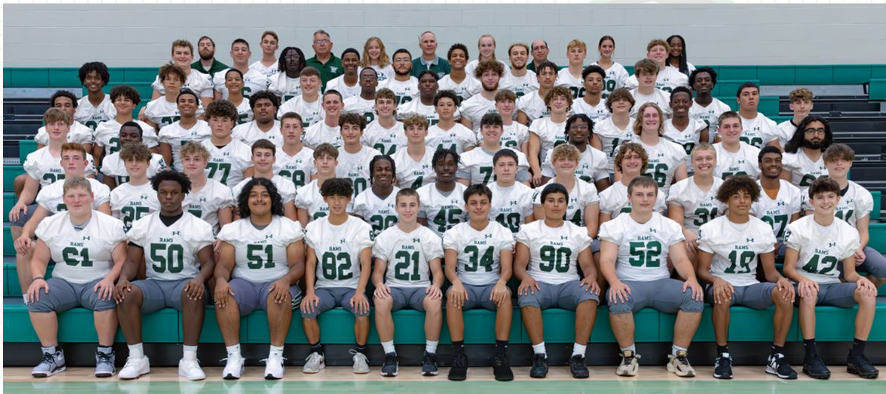
2023 - 2024 CD Football